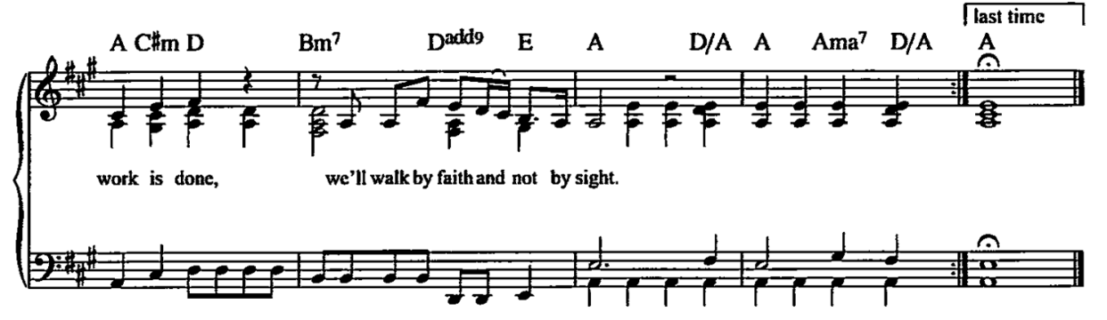
Used with permission by CCLI 11234457